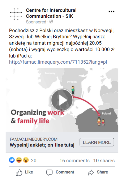
Figure 2. Facebook advertisement featured in users' News Feed

else (e.g. the right-hand side bar). Due to its dynamic affect, a video ad was deemed to be a more attractive alternative than a picture ad, as it automatically starts playing when it appears on users' screens. It was run on all types of device, including desktop computers, tablets and mobile phones. No other advertising platform outside of Facebook, such as Instagram or Audience Networks, was used. Due to privacy concerns and to protect respondents' identity, no tracking (e.g., Facebook Pixel) was used. The Facebook advertising strategy yielded 3,552 complete responses.