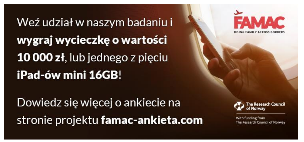
Note: The text in Polish says: 'Take part in our study and win a trip worth 10,000 zl or one of five iPad mini 16 GB! Learn more about the survey at the project's page famac-ankieta.com'.

On 21 April 2017, when it became clear that the airline strategy had failed, a targeted Facebook campaign was launched and ran for 30 consecutive days until 20 May 2017. The objective of the campaign was to generate traffic to the external website which hosted the survey. The campaign had a total budget of NOK 48,635 ( circa US$ 5,655 during the campaign's period). The Facebook ad was organised as an automatic auction aiming at the most link clicks at the best price and had a standard delivery type, normally used for automatic bid pricing. The campaign comprised of a single advert which targeted all Polish-speaking Facebook users aged 20–65+ located in Norway, Sweden and the UK at the time of the campaign. The Facebook ad was an 80-second video explaining the goals of the overall research project, with a short text in Polish about the eligibility criteria, prizes and the link to an external website placed above the video (see Figure 2). Once the user clicked on the ad, he or she was automatically taken to an external website where the survey was hosted. The ad was only placed in users' News Feed and nowhere